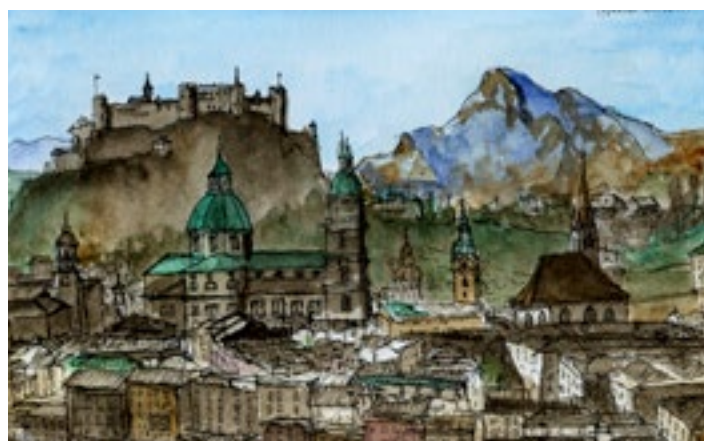
Salzburg, Austria

the journey with us to a solo gallery show. However, by providing the artists with library staff assistance and a lot of encouragement, we mounted two separate student shows in fall and spring terms.