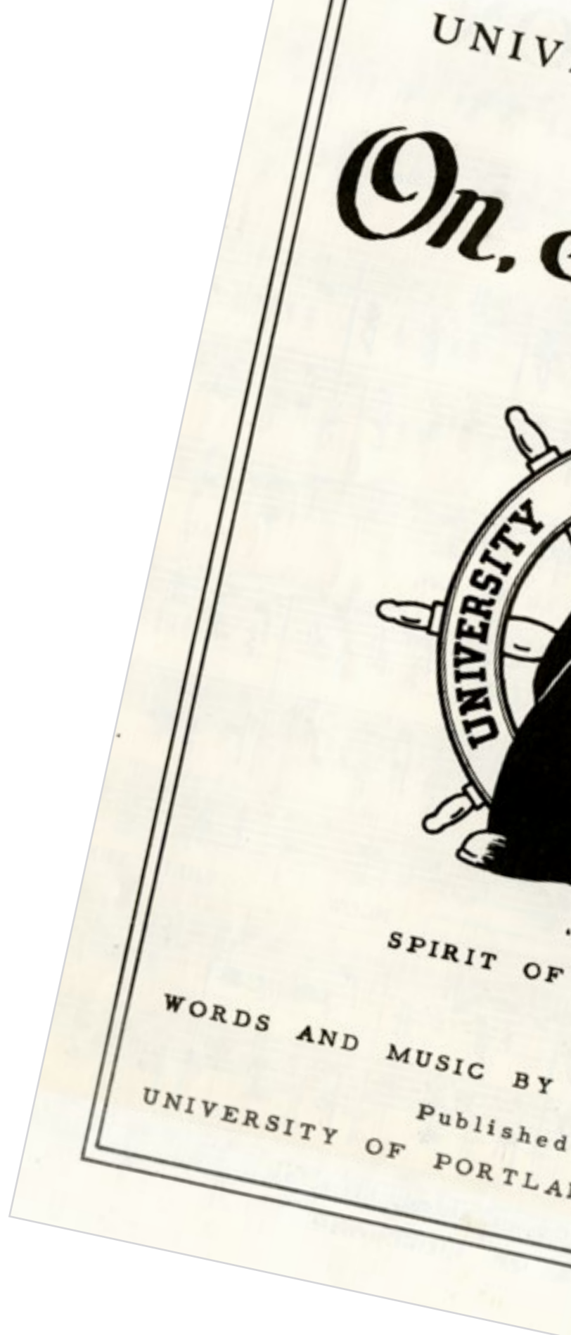
Right: Fight Song and Come All Ye Sons , spirit song sheet music, 1939 Left: On Pilots On , pep song sheet music, 1952

These critical and celebratory glimpses of the past provide today's UP community with a better understanding of the University's complex history.